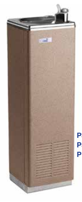
P3CP P5CP P<sub>10</sub>CP