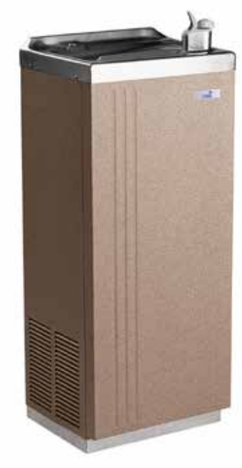
P8FA PLF8FAH P14FA PLF14FAH