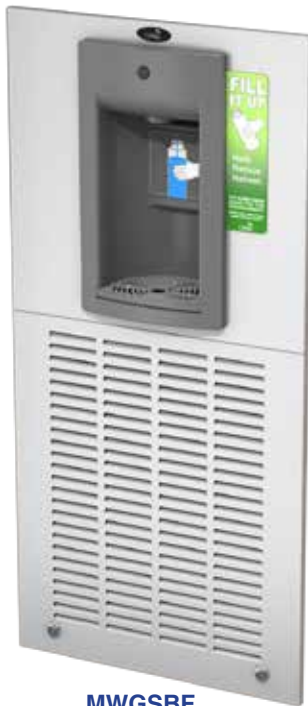
MWGSBF MWG8SBF MWG12SBF