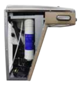
Oasis VersaFilter system can be factory-installed at additional cost.