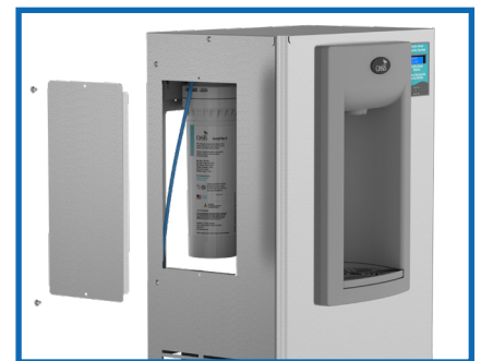
Filter mounts through the side of the bottle filler cabinet for clean and easy filter exchanges.