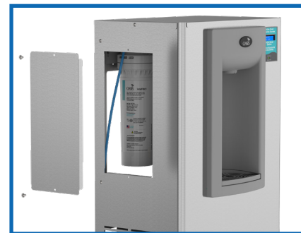
Filter mounts through the side of the bottle filler cabinet for clean and easy filter exchanges.

The ELKAY trademark is registered and owned by Elkay Manufacturing Company. OASIS International is not affiliated with Elkay Manufacturing Company in any way. No OASIS International Products are associated or affiliated with, sponsored or endorsed by the Elkay Manufacturing Company. Installation of the NNEBFEZ could void the original water fountain warranty.