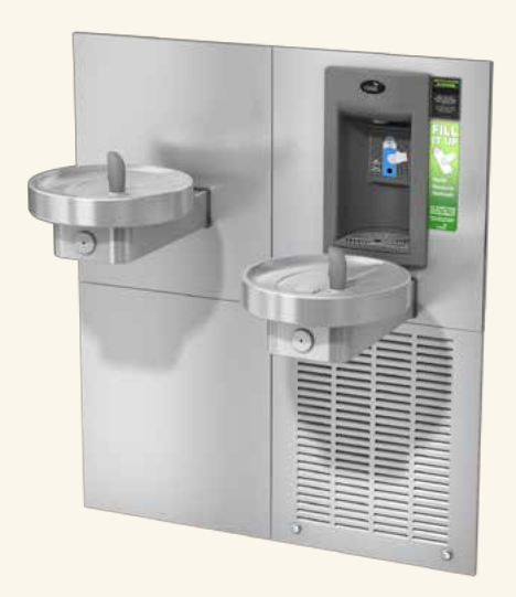
M8CREBFY Bi-Level (60 L/hr chiller)