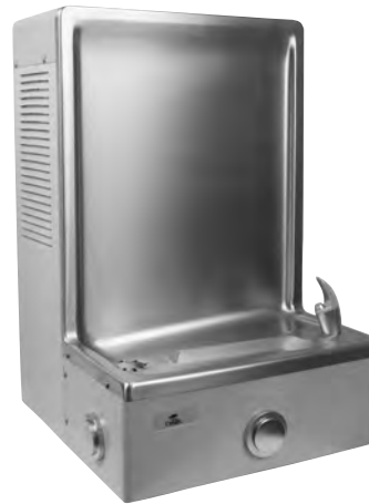
Sandstone Powder Coat Finish