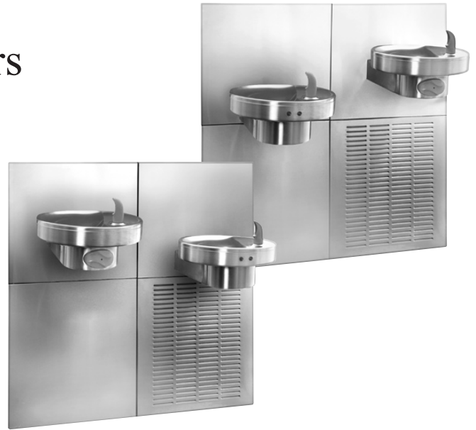
Universal: high right or high left.